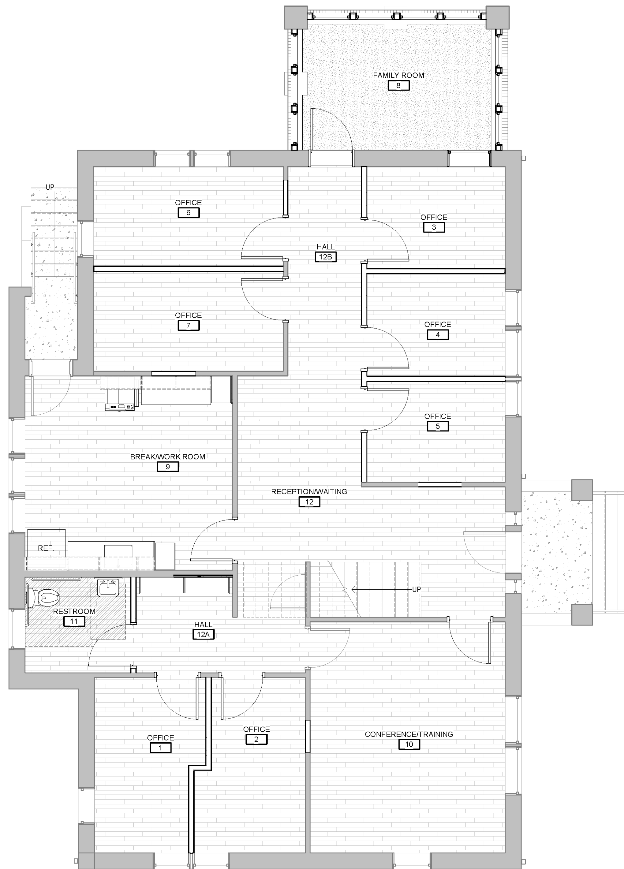
A1 FINISH PLAN - LEVEL 1 1/4" = 1'-0"